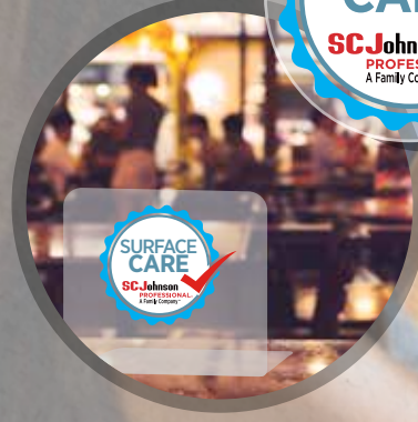
TABLE TOP CARD PLACEMENT

Contact your sales representative for details.