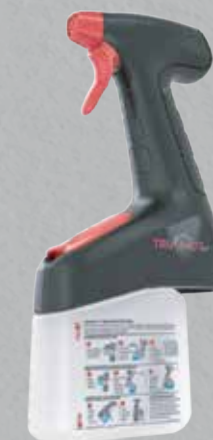
Multi-Surface Disinfectant = 28 In Use Quarts