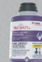
Power Cleaner / Degreaser = 13 In Use Quarts