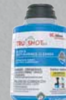
Glass Cleaner = 43 In Use Quarts

Powerful non-butyl, alkaline formulation with soil-lifting surfactants for exceptional cleaning. Clean Fresh Scent.