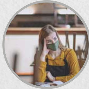
Trying to Stay Innovative During Chaos