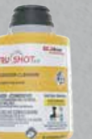
Restroom = 18 In Use Quarts

Removes dirt, grease, oils, dust and grime. Ideal for daily cleaning of a variety of surfaces. Clean Fresh Scent.