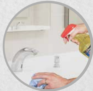
Cleaning and Disinfecting Increased

Through the pandemic, restaurants had to rethink their strategy.