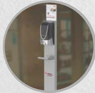
Public Hand Sanitizing Enhanced