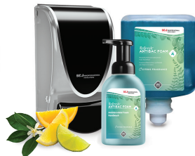
Refresh Antibac Signature Fragrance Invigorating Citrus