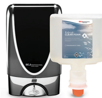
Refresh Clear Dye-Free & Fragrance-Free