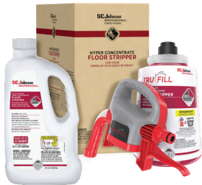
ONE STRIPPER Fast, Efficient Removal Low-Odor Formulation