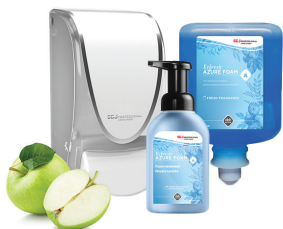
Refresh Azure Signature Fragrance Fresh Apple