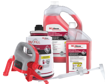
ONE CLEANER Patented Low-Foaming, Low Residue Formulation