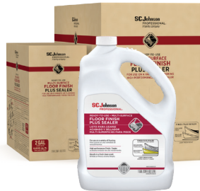
ONE FINISH Durable FlexiFilm Technology™ Resists cracks, haze, dirt, scuffs and black heel marks.