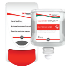
InstantFOAM Complete PURE Dye-Free & Fragrance-Free