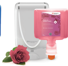
Refresh Rose Signature Fragrance Enchanted Rose