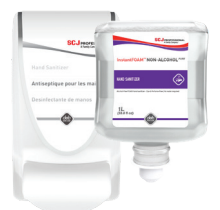
InstantFOAM Non-Alcohol PURE Dye-Free & Fragrance-Free